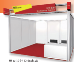
展台设计仅供参考 For Reference Only

每平方米 美元 $460 / 人民币 ¥3,100 US per sq.m. / RMB per sq.m.