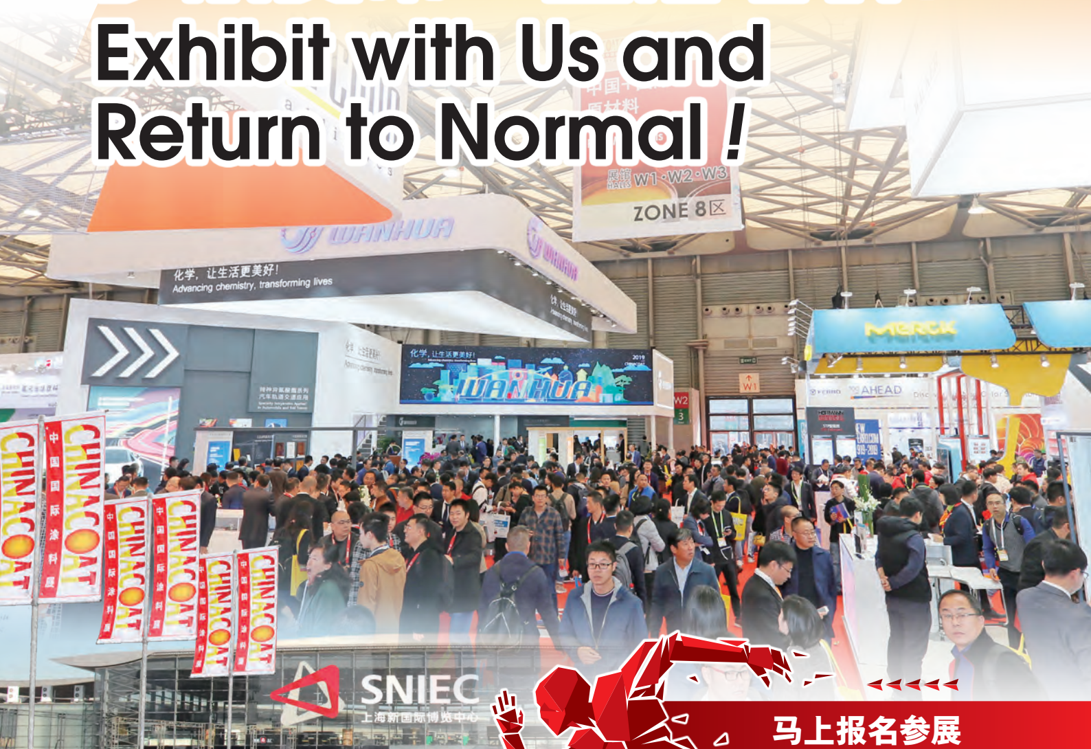
Exhibit with Us and Return to Normal!

上海新国际博览中心 Shanghai New International Expo Centre (SNIEC)