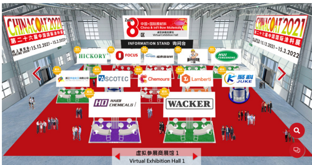
Figure 3: The "Virtual Exhibitor Zone" page of CHINACOAT2021 Online Show.