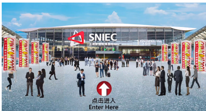
Figure 1: The landing page of CHINACOAT2021 Online Show.

The 2021 exhibition will continue to be staged online at www.chinacoatonline.net , which is already live and will stay open until March 15, where visitors can continue visiting over 900 exhibitors online. From March 2 onwards (original opening date of the Physical Show), visitors can also watch live or pre-recorded videos such as Exhibitors' Live Broadcasts, Webinars, Editor's Recommendations, etc. Registered visitors of our Physical Show should have received an email from us to login to the Online Show directly, without having to go through the registration process. If you have not registered to visit before, please register now to start browsing our Online Show right away!